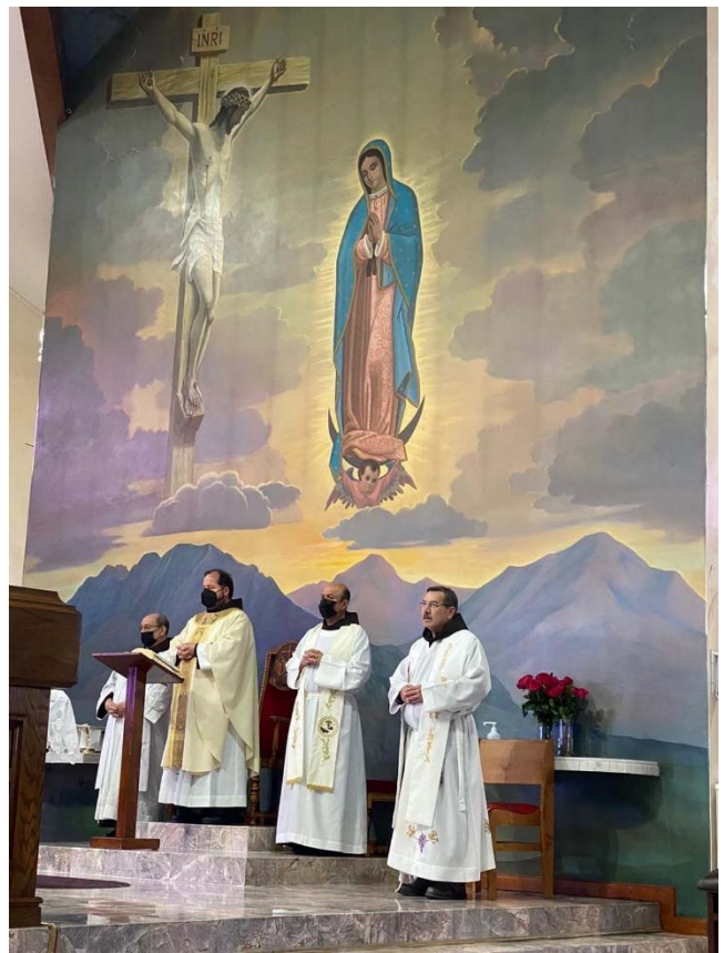
Below: Members of San Luis Rey Fraternity