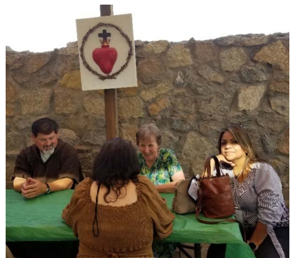
Dinner at the Riviera Restaurant